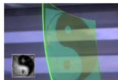
Image 2: A comparison between the (ground truth) image being focused on the sensor surface and the reconstructed image (inset).

The sensor is based on a polymer film known as a luminescent concentrator (LC), which is suffused with tiny fluorescent particles that absorb a very specific wavelength (blue light for example) and then reemit it at a longer wavelength (green light for example). Some of the reemitted fluorescent light is scattered out of the imager, but a portion of it travels throughout the interior of the film to the outer edges, where arrays of optical sensors (similar to 1-D pinhole cameras) capture the light. A computer then combines the signals to create a gray-scale image. “With fluorescence, a portion of the light that is reemitted actually stays inside the film,” says Bimber. “This is the basic principle of our sensor.”