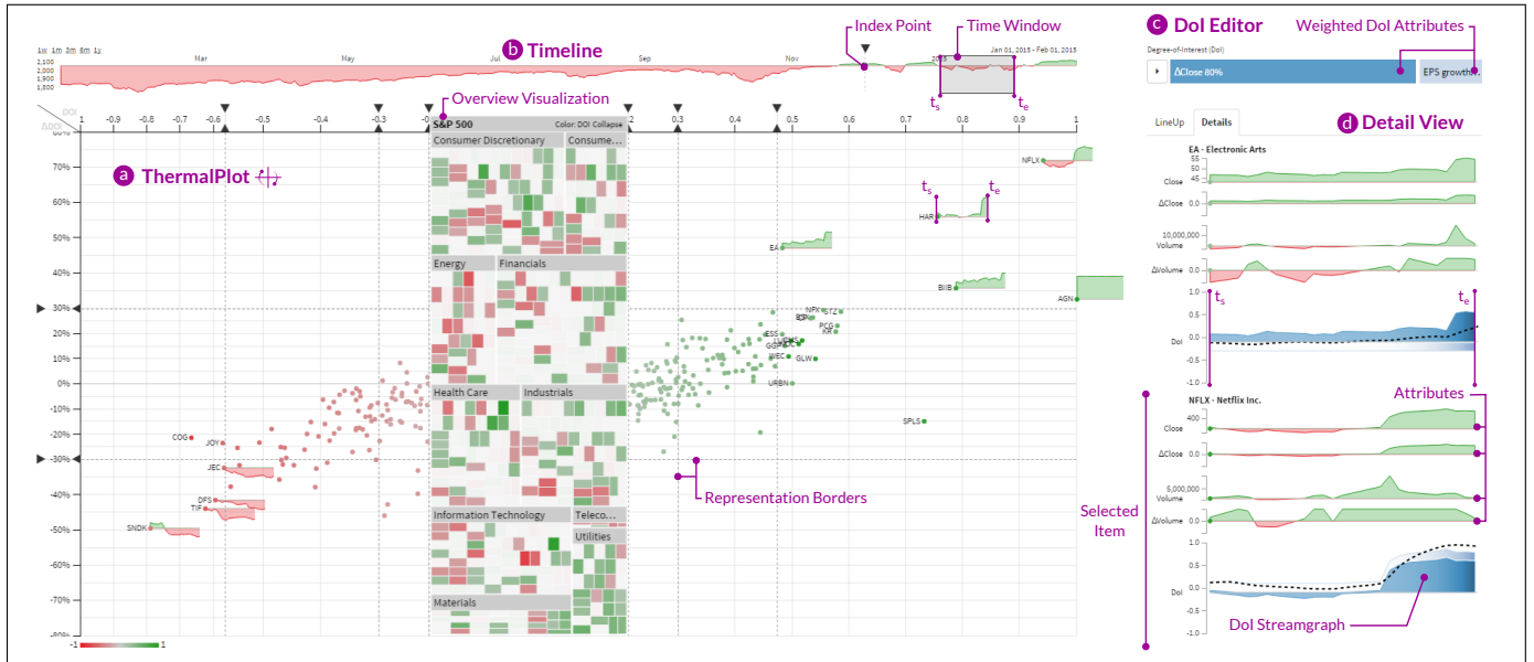
Figure 1: The ThermalPlot technique (a) integrated in the exploration environment for multi-attribute time-series data showing the development of companies listed in the S&P 500 index within a user-specified time window (b). Item positions in the plot are based on the selected index point and the weighted DoI attributes configured via the DoI editor (c). The detail view (d) shows the development of the composed DoI over time as streamgraphs and the line charts of single attributes for selected items.

Marc Streit§ Johannes Kepler University Linz